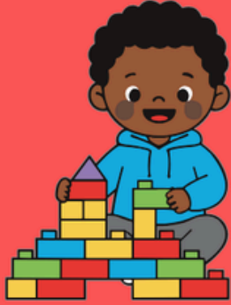
BUILDING WITH BLOCKS