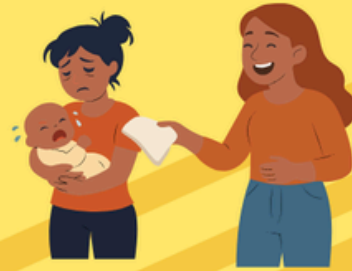
OFFERING A TISSUE