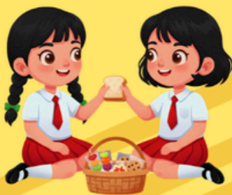
SHARING A SNACK